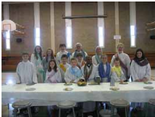
SJC students and staff gathered in prayer on Holy Thursday.

SJC second graders concluded their study of the continent of Australia with a visit from some very exciting guests — Australian animals! A kangaroo, bearded dragon, saltwater crocodile and sugar glider all visited our school! It was an exciting day and a great way to learn about animals and our environment!