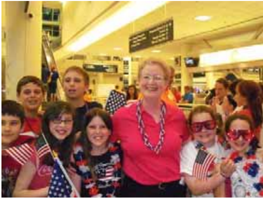
Honor Flight Welcome Home!