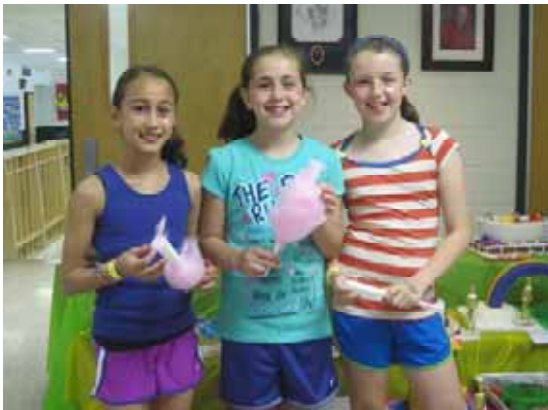
Celebrate SJC Day