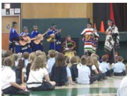
Friends of the Orphans Visit SJC

SJC students were delighted to learn valuable economic lessons from Junior Achievement representatives from United Parcel Services.