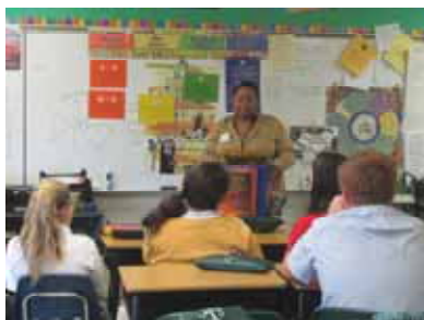
Junior Achievement Visits SJC

SJC students were delighted to learn valuable economic lessons from Junior Achievement representatives from United Parcel Services.