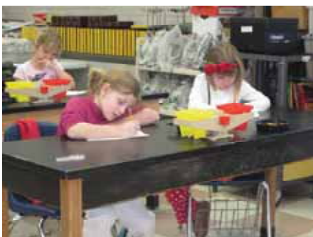
Second Grade was hard at work in the Science Lab!