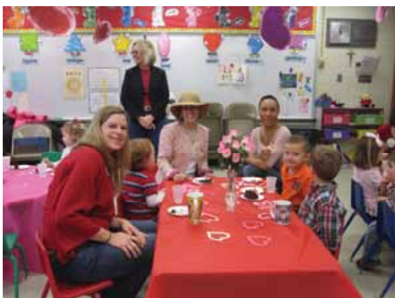
Preschool students enjoyed a Valentine's Day Tea!