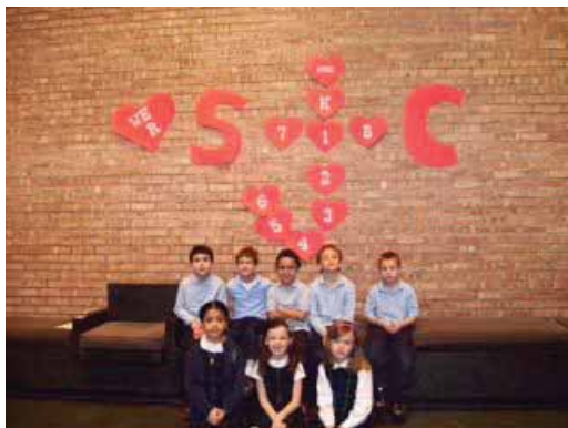
First Graders planned the All School Liturgy!