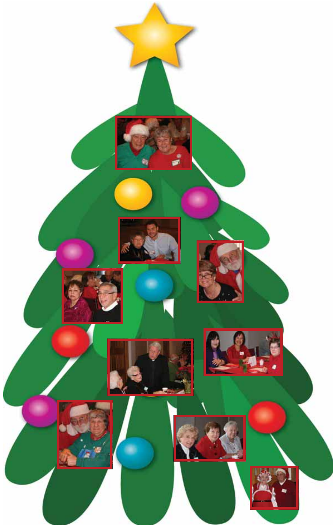
Senior Christmas Party