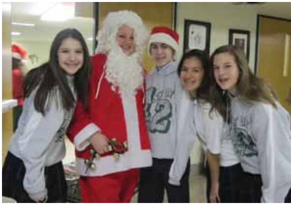
St. Nicholas Day