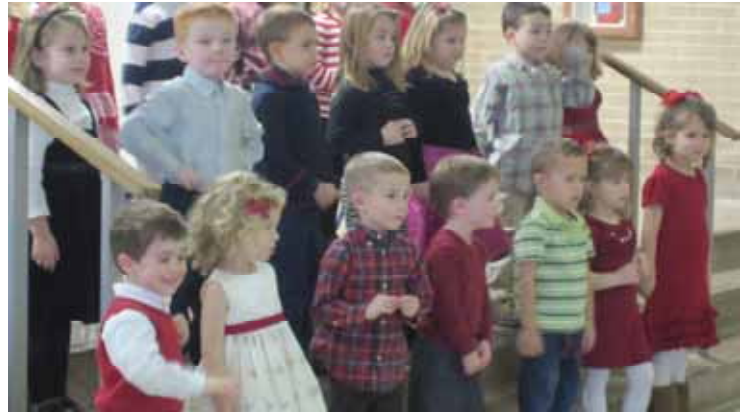
Preschool Christmas Program