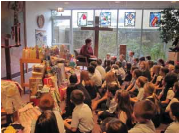
Breakfast with the Baby Jesus