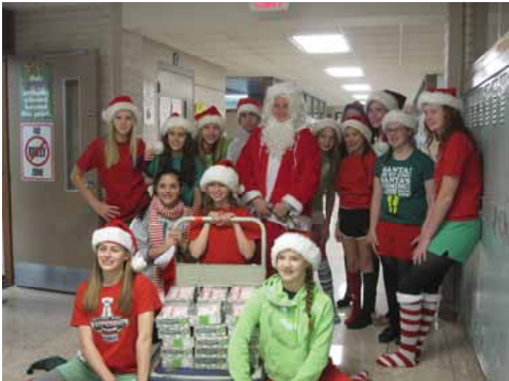
St. Nicholas Day