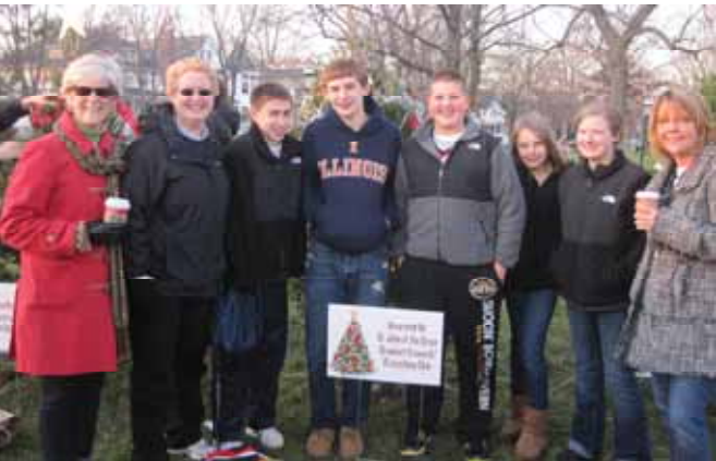
Western Springs Tree Trimming