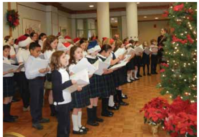
Choir at Bethlehem Woods