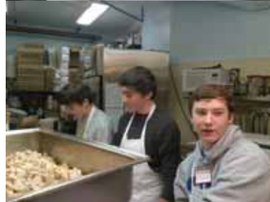
Prepping food & cleaning at Feed My Starving Children

Great job Pruitt home group & all our friends who joined the FMSC afternoon!