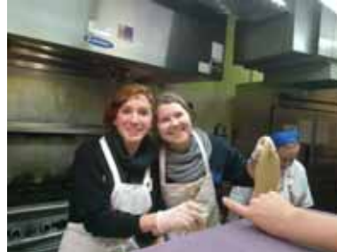
Gazdacka group cooking at Inspiration Café

Many thanks to those who have given extra of themselves to ensure food is provided to those in need: