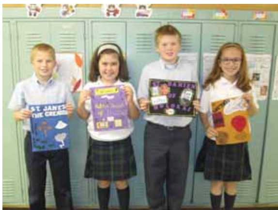
SJC fifth grade students studied the lives of Saints. They selected one Saint to research and wrote a Saint report and a prayer, and constructed a Saint banner.