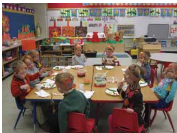
Preschool children decorated turkey hats and celebrated with a Thanksgiving feast!